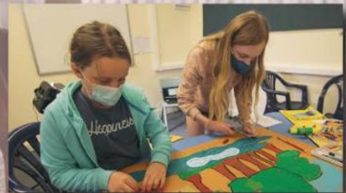
Children from Oratia Primary School preparing animation artwork